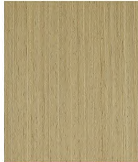
TL-B SILVER OAK 2Q