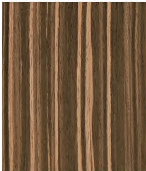
TL-B EBONY 3036S