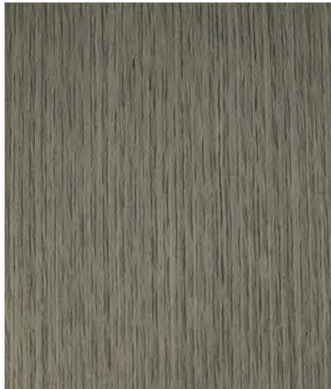
TL-E ITALIAN SANDERS 3#