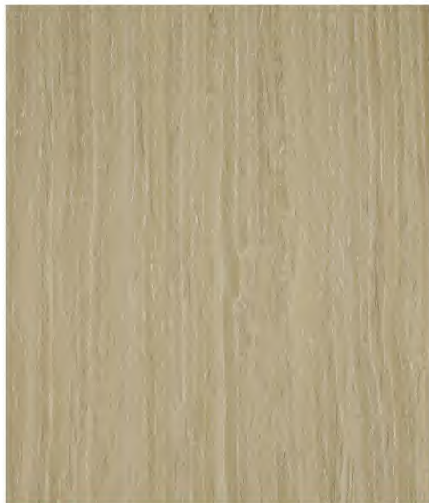
TL-C WASHED SILVER APRICOT