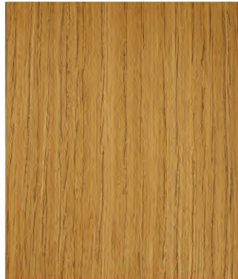
TL-B TEAK 5410S