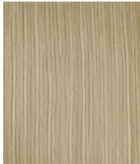
TL-B SILVER APRICOT 780S