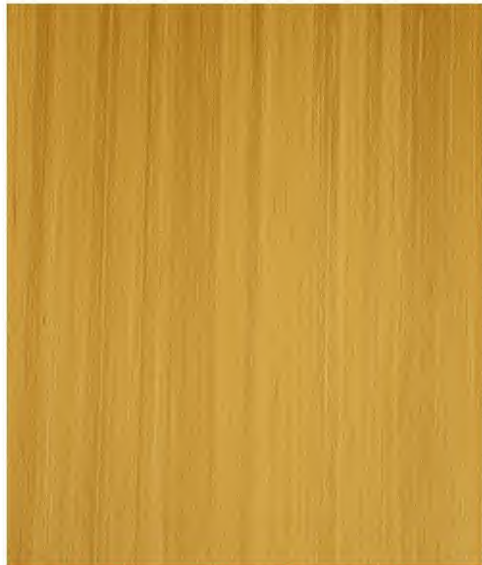
TL-C TEAK 612Q