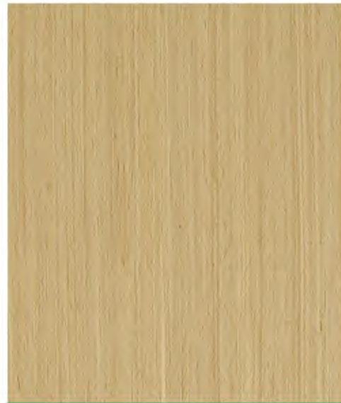
TL-A ASH 5042