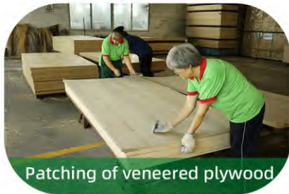
Patching of veneered plywood