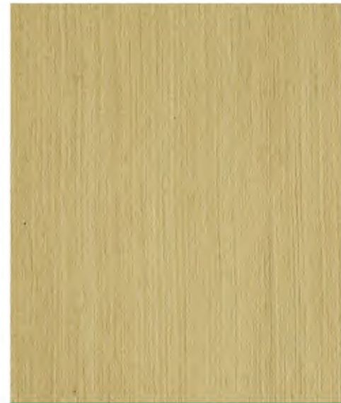
TL-C ASH 6228