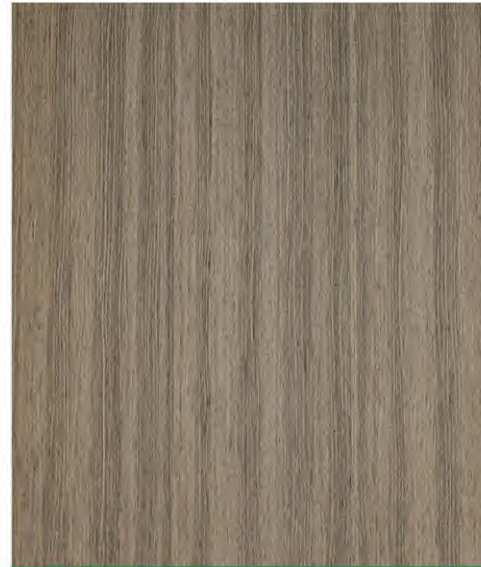
TL-E NISLAND 8#