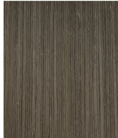
TL-C WASHED BLACK OAK 19S