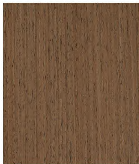
TL-A WENGE 101