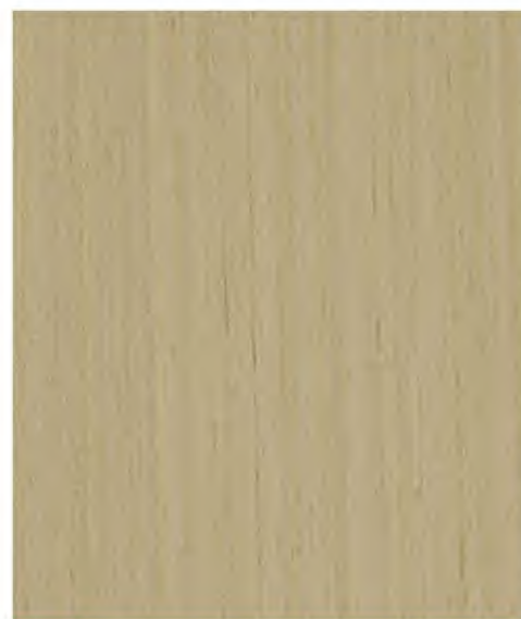
TL-F BFAUTIFYING WOOD 7135