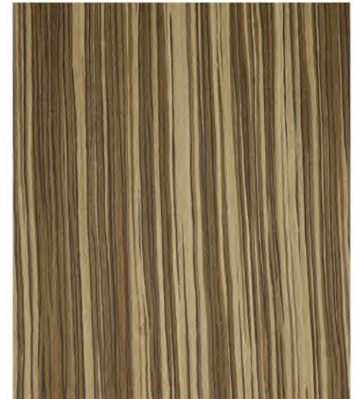
TL-C EBONY 321