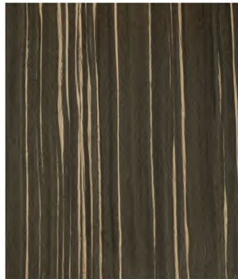
TL-D EBONY 149S