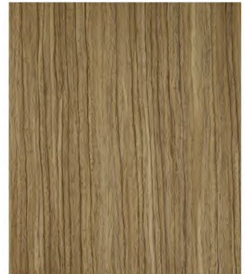
TL-B WALNUT 2427S