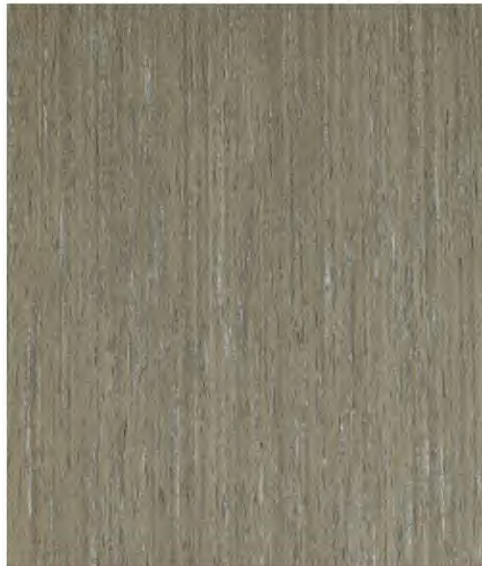
TL-D SILVER OAK 495Q