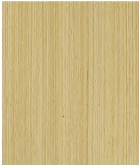
TL-E ANIEGRE 2#