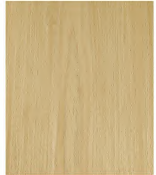
TL-E PINE 8363