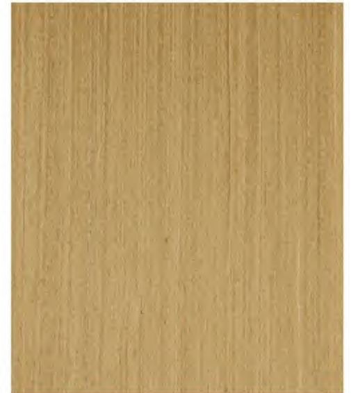
TL-A OAK 11