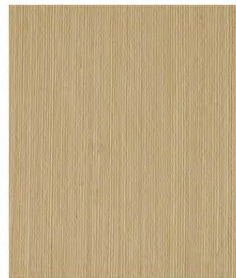
TL-A SILVER FIR 18S