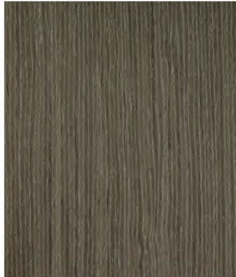
TL-D BLACK APRICOT 506S