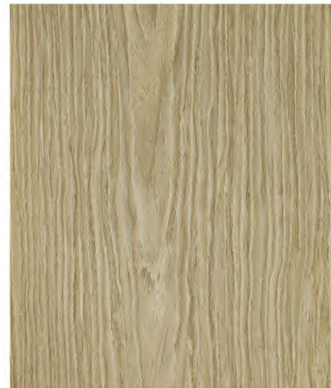
TL-B SILVER APRICOT 801C