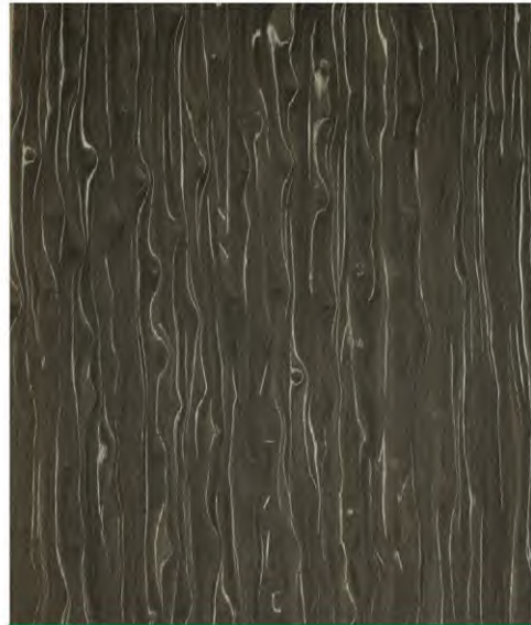
TL-E BLACK ICE TREE