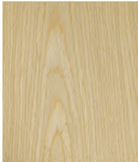
TL-A WHITE OAK 28CB