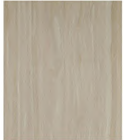
TL-E ITALIAN WHITE OAK 1#