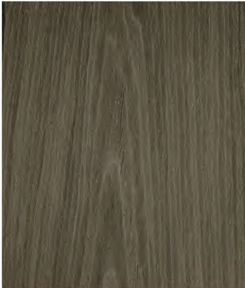
TL-D BLACK APRICOT 506C