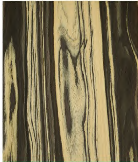
TL-F LANDSCAPE EBONY