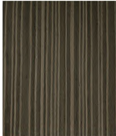
TL-C EBONY 27S