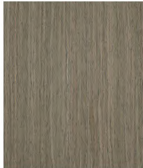
TL-D SILVER OAK 197S