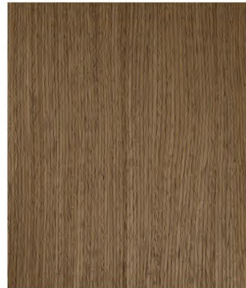
TL-A WALNUT 119