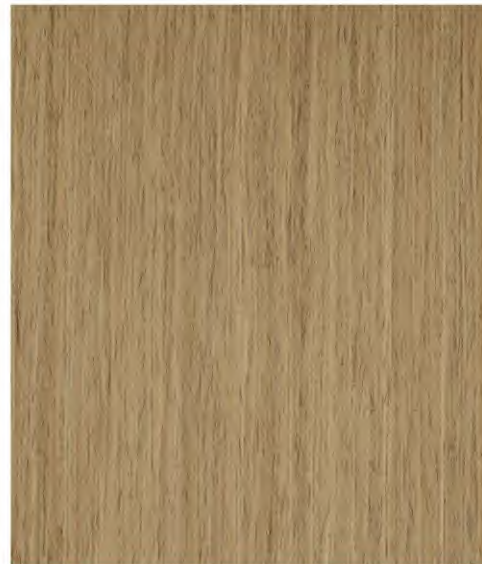
TL-B WALNUT 2062S