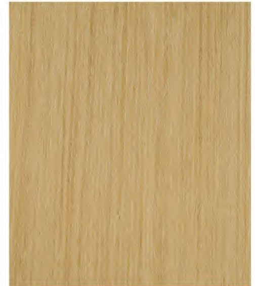
TL-C WASHED RED OAK 23S