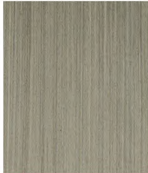
TL-C SILVER OAK 2#