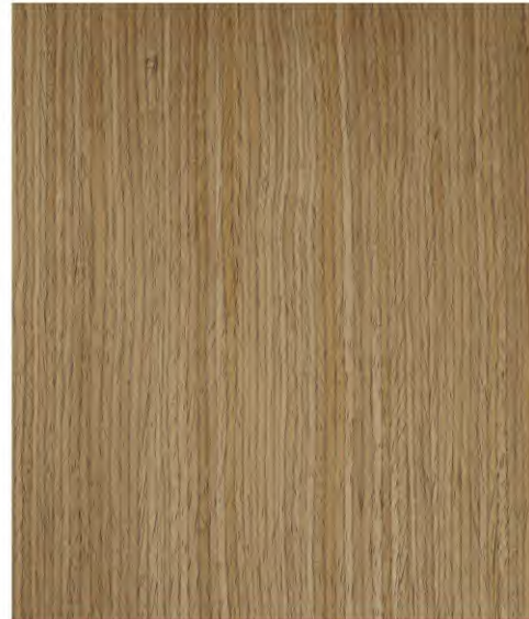
TL-C LIGHT ROSEWOOD