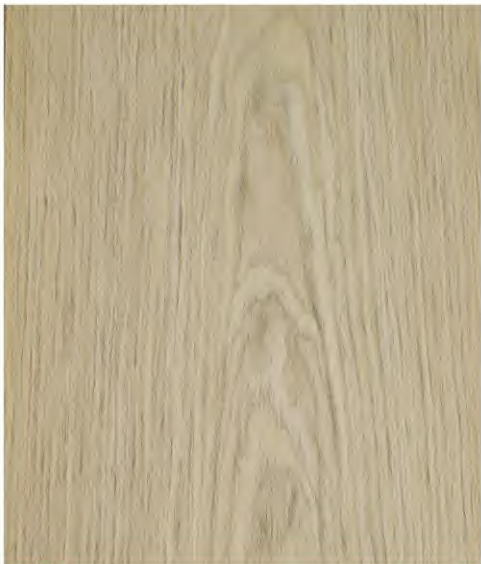
TL-E ITALIAN WALNUT 9329