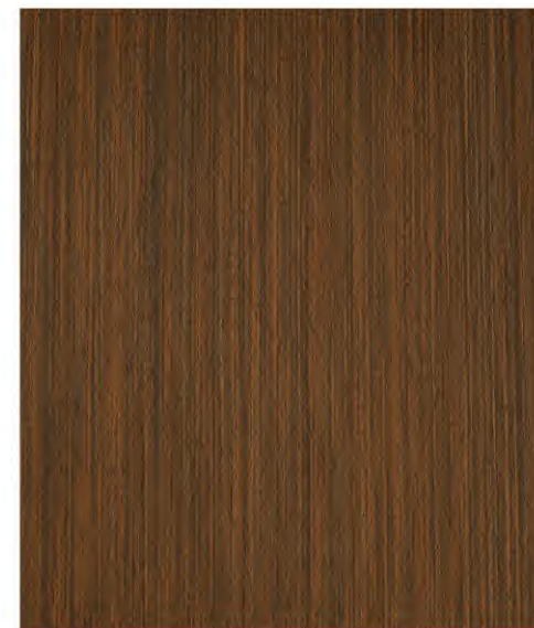
TL-D WENGE 6780