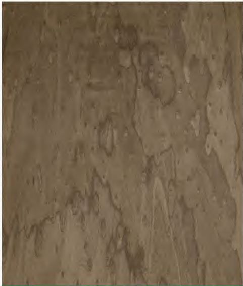
TL-F MATT BIRD'S EYE