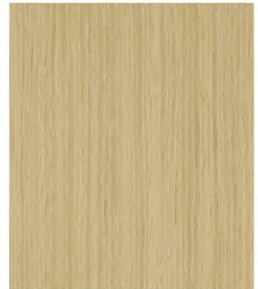
TL-C WASHED WHITE APRICOT