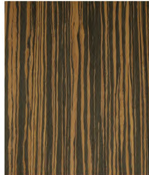
TL-C EBONY 12#