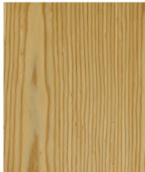
TL-A CHINESE ASH C