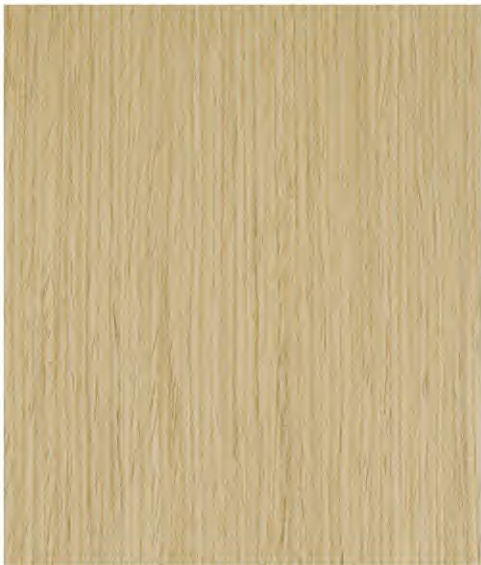
TL-A WHITE OAK 28AS