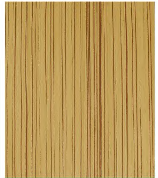
TL-A WHITE ZEBRAWOOD SP