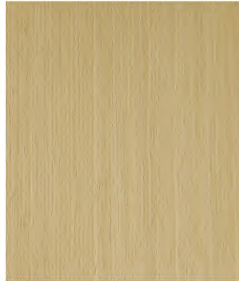
TL-C WHITE OAK 21S