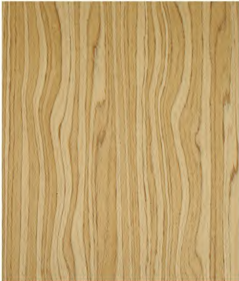
TL-D OLIVEWOOD 360