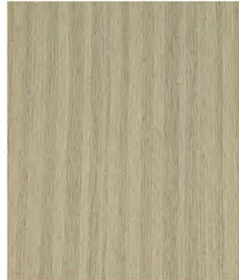
TL-E YELLOW LACEWOOD 89#