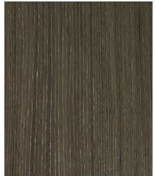
TL-D SILVER EBONY 383S