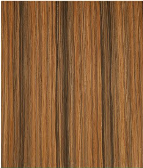
TL-B ROSEWOOD 5248S