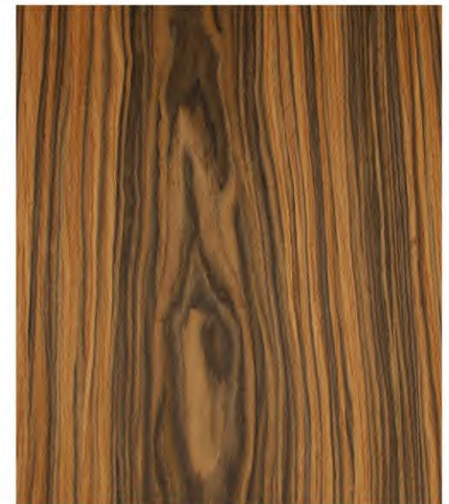
TL-B ROSEWOOD 5248C