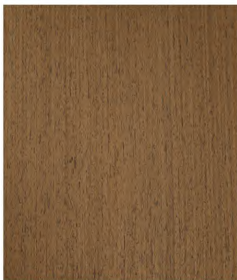
TL-A WENGE 5247