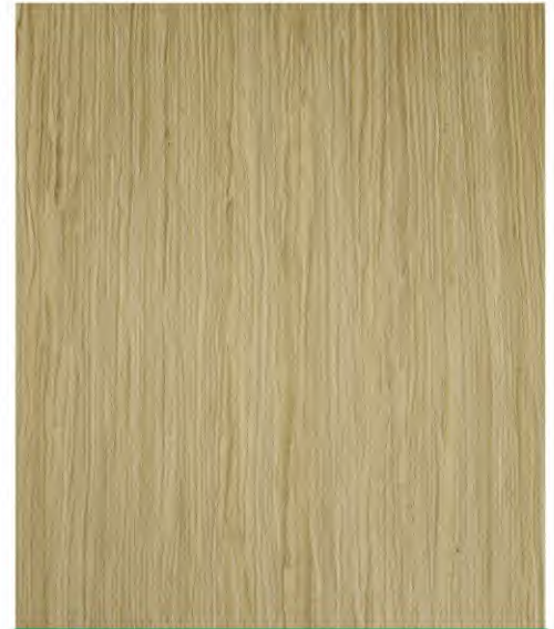
TL-D APPLEWOOD 897S