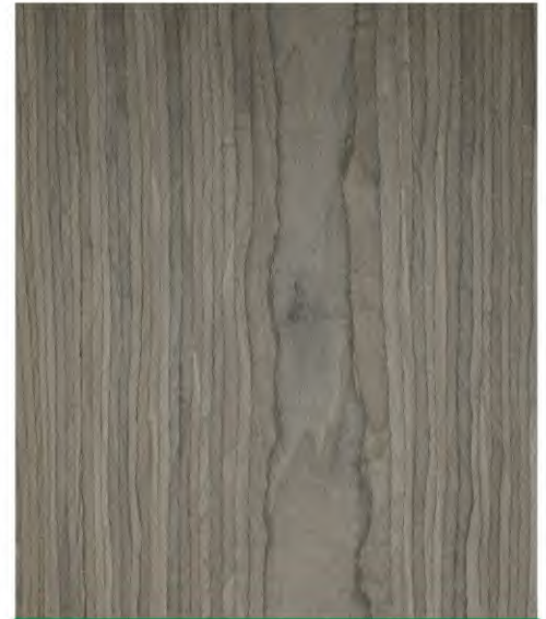
TL-F BLUE STONE