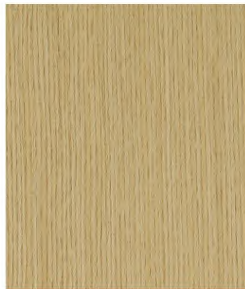
TL-B CHINESE ASH 5170S