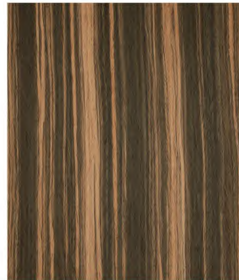
TL-E EBONY 2779