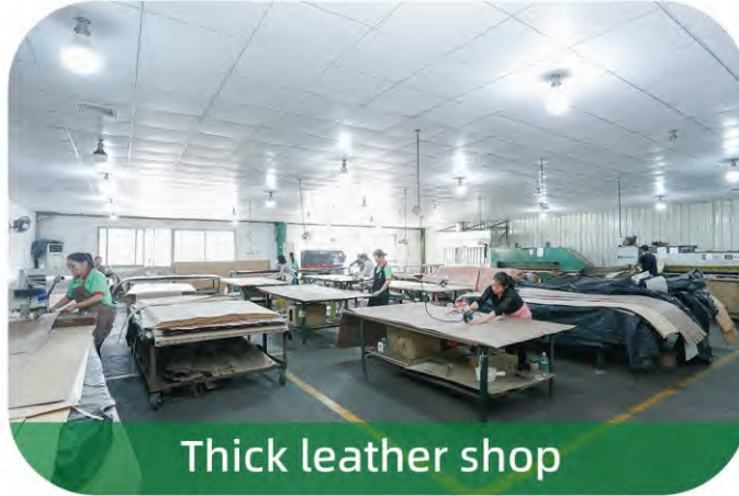
Thick leather shop