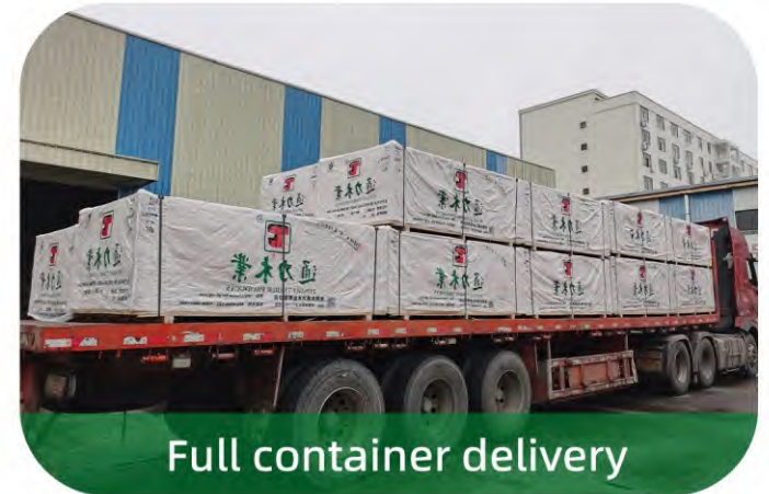
Full container delivery

WE HAVE A COMPLETE SHEET CUSTOMIZATION SYSTEM AND FAST DELIVERY ABILITY