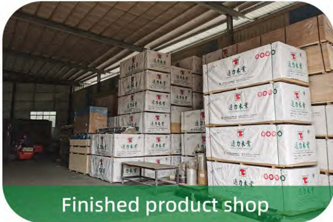
Finished product shop