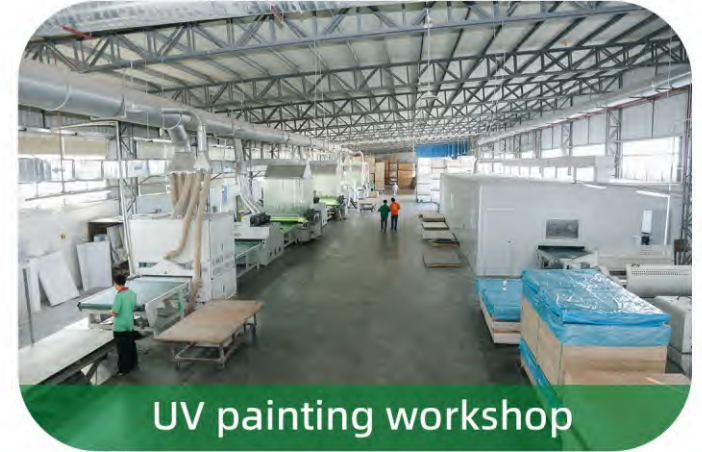
UV painting workshop