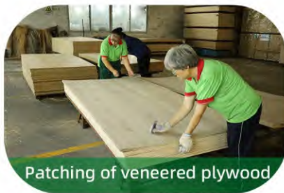
Patching of veneered plywood