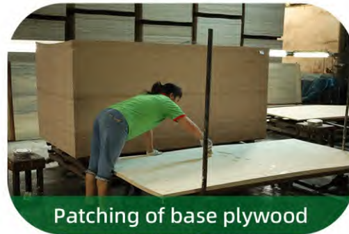
Patching of base plywood